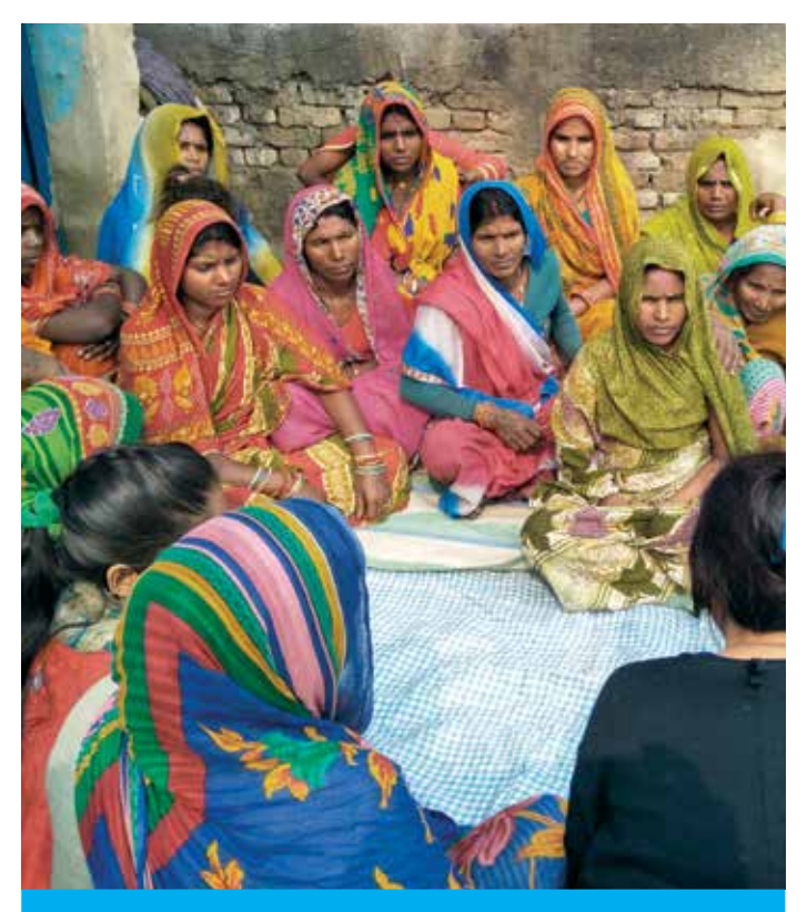
SNV in Nepal: Formative research with Dalit women on hygiene behaviours in Mansighpatti, Dhanusa