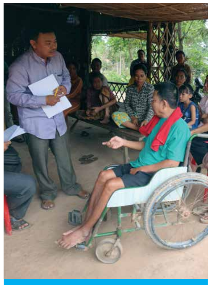
SNV in Cambodia: Sanitation planning activities with PLWDs